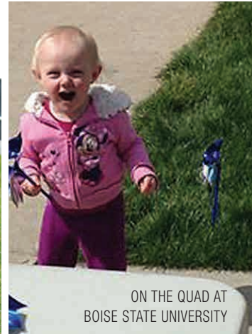
ON THE QUAD AT BOISE STATE UNIVERSITY