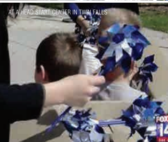
AT A HEAD START CENTER IN TWIN FALLS