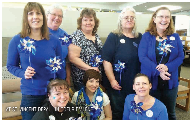
AT ST. VINCENT DEPAUL IN COEUR D'ALENE