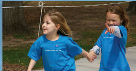
Head start students in Twin Falls catch up to Walk for Prevention

The campaign reached more people and organizations this year than ever before.